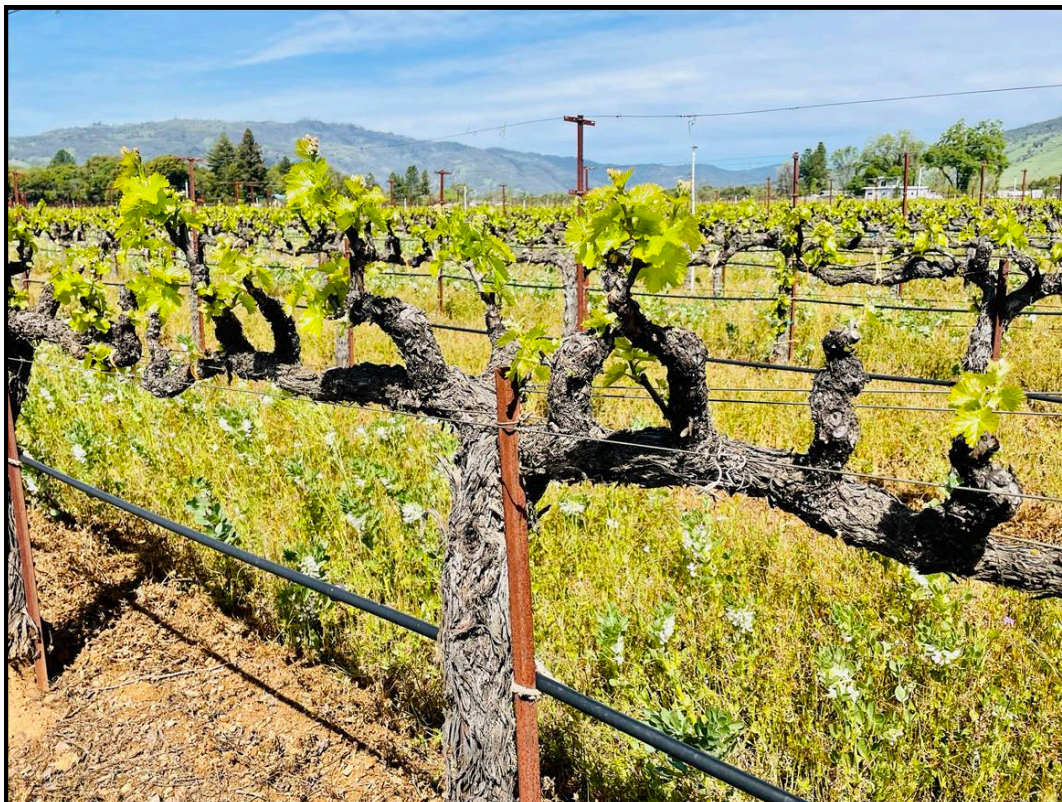
Tollini Vineyards Grenache Noir